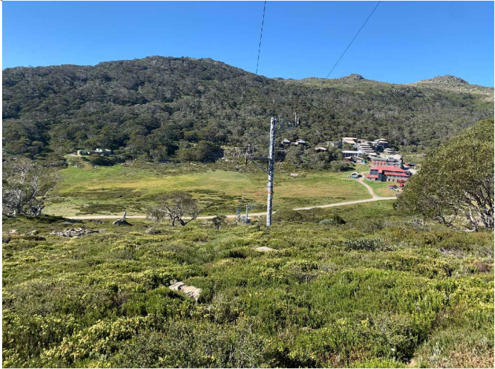
VIEW OF ACCESS TO TOWER 2, TOWER 3

Note on road crossing: Tower 4 is located 37m uphill of Kosciuszko road centerline Tower 3 is located 62m below the Kosciuszko road centerline